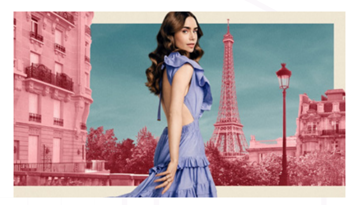
'Emily in Paris' star says he partly understands why critics panned the 'cliché' Netflix show

Despite being a huge hit for Netflix, critics across the board (particularly French critics) have slammed the show for indulging in outdated and offensive stereotypes that present Parisians as rude, sexist, and elitist.